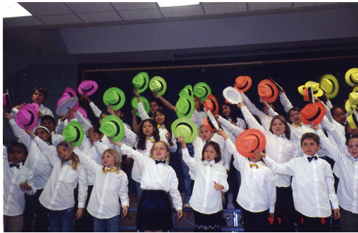
Jefferson Jaguar Singers