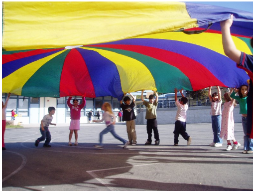
First Grade P.E.